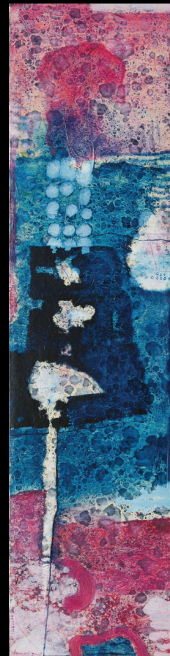
Pleasure in Broken forms 7