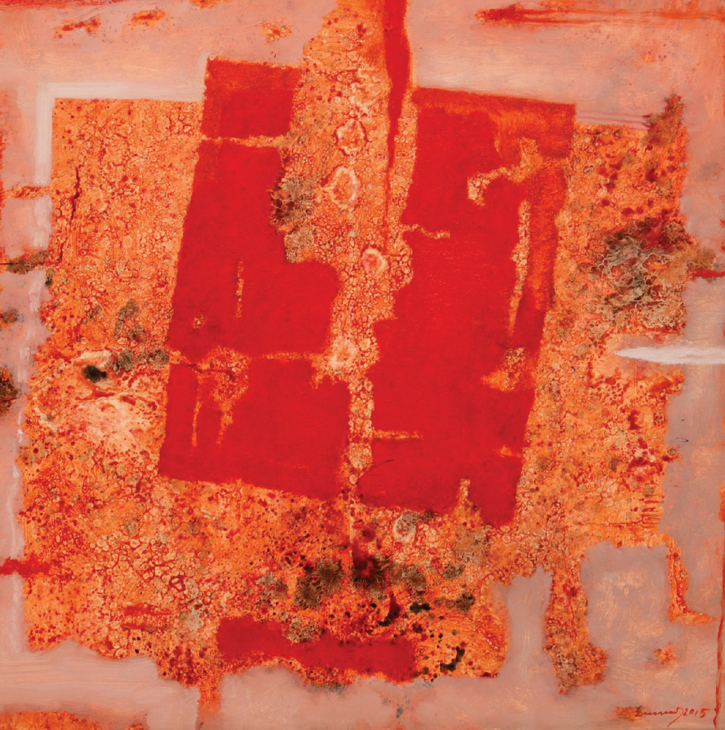
Red Composition 2