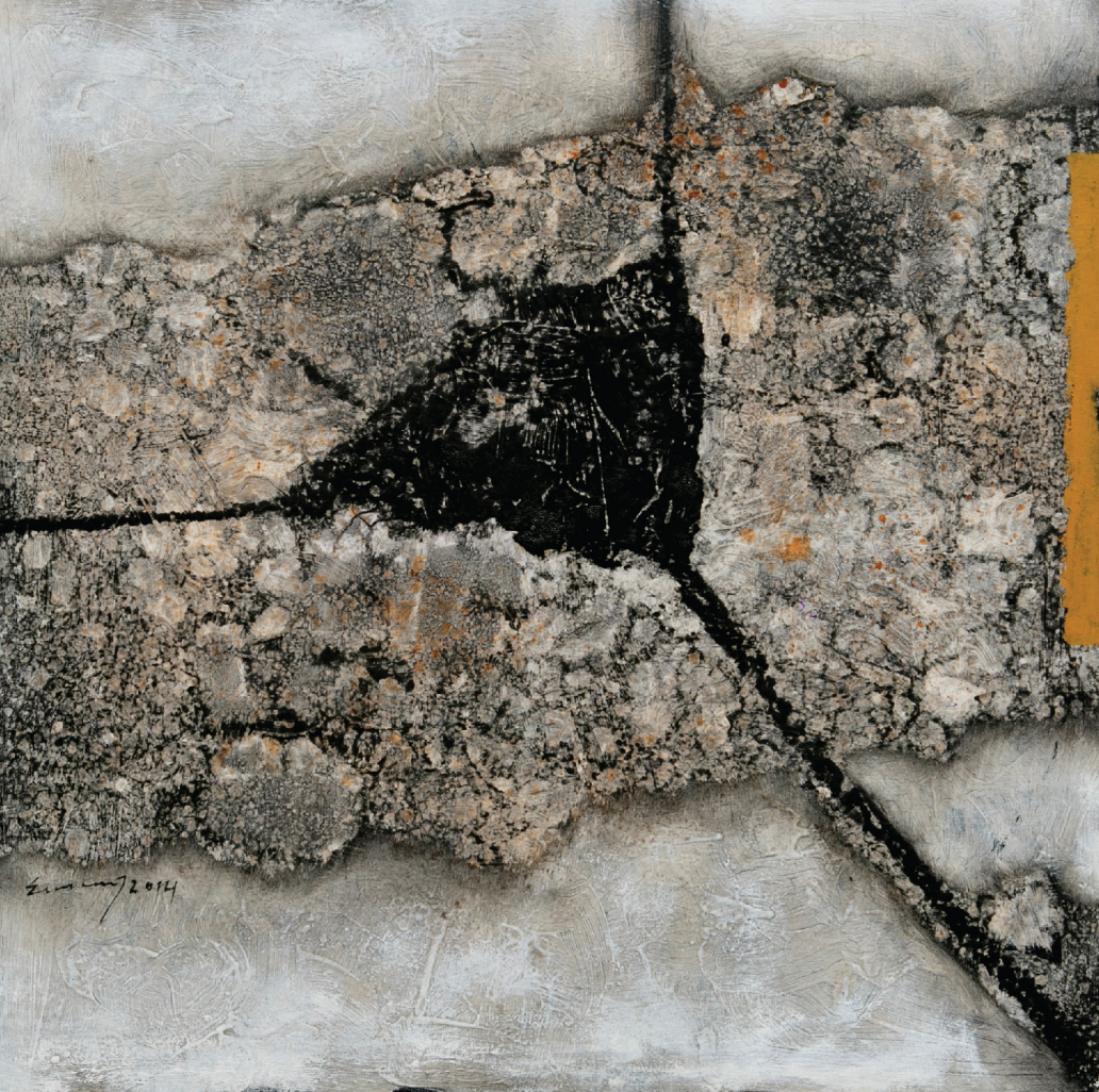
Story of a Wall 3