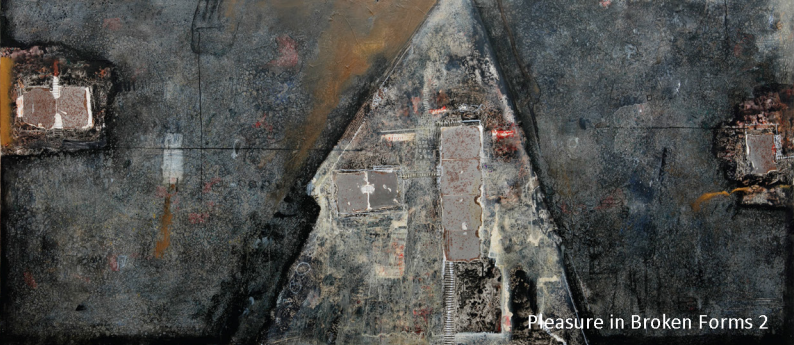
Pleasure in Broken Forms 2

As other brilliant young artists in his early days, Eunus showed his acquisitiveness towards the interplay of landscape-nature with light-shadows. His water colours were vibrant with minimal interventions and can be marked as the finest works in this medium. Eunus has fostered himself through a perfect process of practice and never intended to skip the steps. This might have been the reason for his steady growth to reach the pinnacle. In the course of time, like all successful artists, Eunus devotes himself to different stages to reach the apex. He exerts his efforts religiously in producing paintings and works simultaneously on several of them. This is quite unique for an artist shifting his thoughts from one to another in a given frame of time. This indicates Eunus' meticulousness in perceiving life and finally putting them into his works. As mentioned earlier, Eunus' journey of almost four decades is covered with several experimentations and styles, and his withdrawal from the illustrating imagery in art put him in the cluster of 'Abstractionist'. He liberated himself from what he started with and excelled with the abstractions.